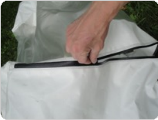
9 Close the Lamp Access Zipper & fold the velcro flap back into place.