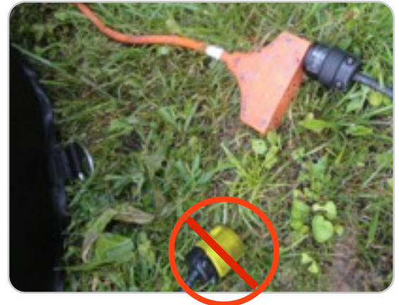
12 Plug in the Blower Power Cord ONLY. NEVER PLUG IN THE LIGHT UNTIL INFLATED!