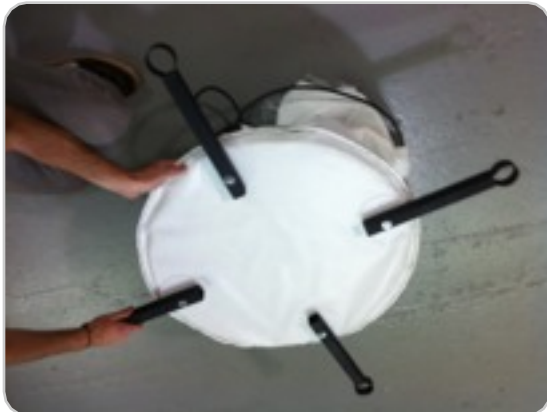
3 The 4 legs should be rotated until they are in the 'Cross' orientation shown above.