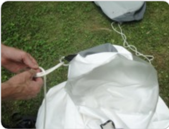
11 Be sure a Control rope is attached to the webbing tab at the top of the tower. This will be used to control the tower during inflation & deflation.