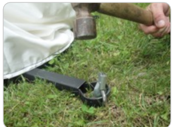
6 If not using sand bags, use stakes through the steel 'eyes' on the ends of the extensions for extra stability in wind windy conditions.