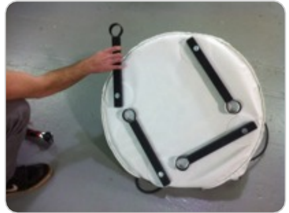
2 Remove from bag & rotate swing out the extension legs on the base.