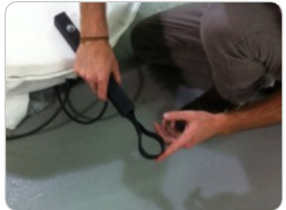
4 The Stake loops on the end of each leg may be extended to give a longer, more stable extension.