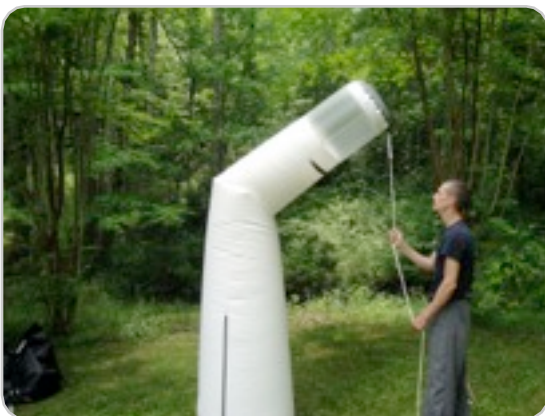
13 As the tower inflates, hold slight down-pressure on the control rope to guide the ascent of the top of the tower.