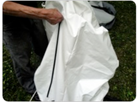
10 Locate the large zipper at the base of the tower and close.