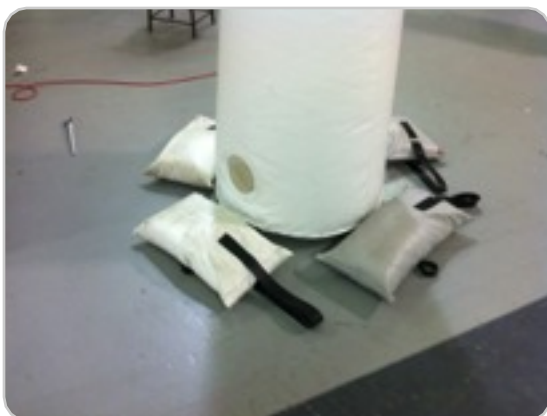
5 You can place sand bags or other weights on the extended legs for stability.