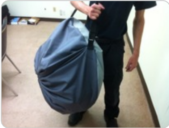
1 Your Light Tower, shown in 'Carrying' mode, in its included, carrying bag.