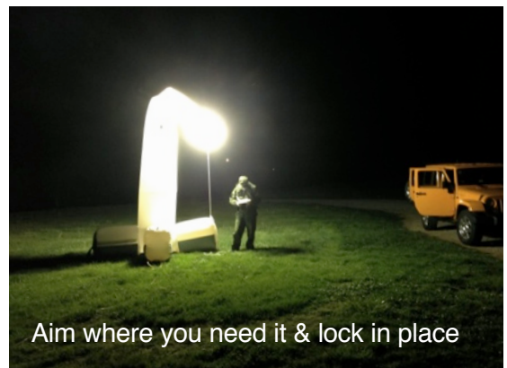
Aim where you need it & lock in place