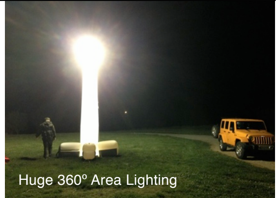
Huge 360° Area Lighting

Our towers are manufactured in Cookeville, TN by the same skilled craftspeople that build balloons and airships for the US military.