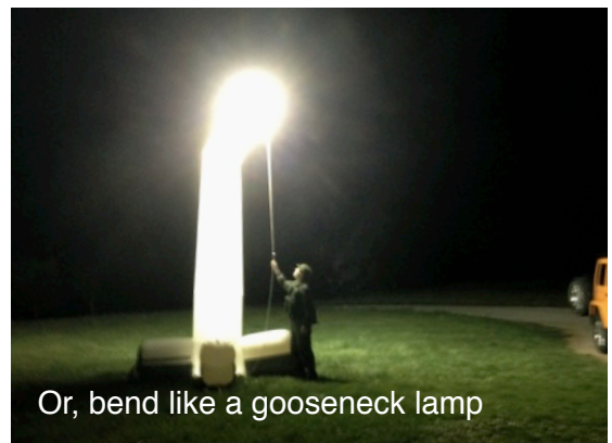
Or, bend like a gooseneck lamp